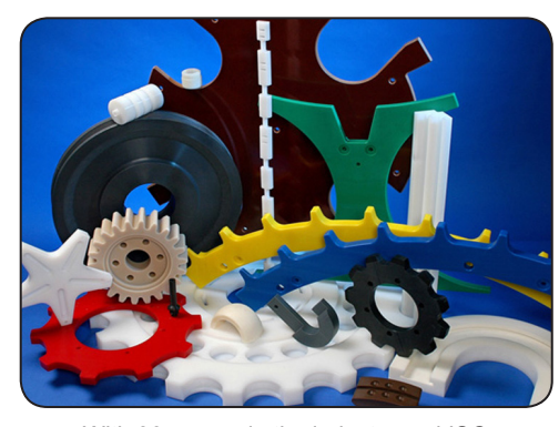
With 30+ years in the industry and ISO certification you can count on high quality parts.