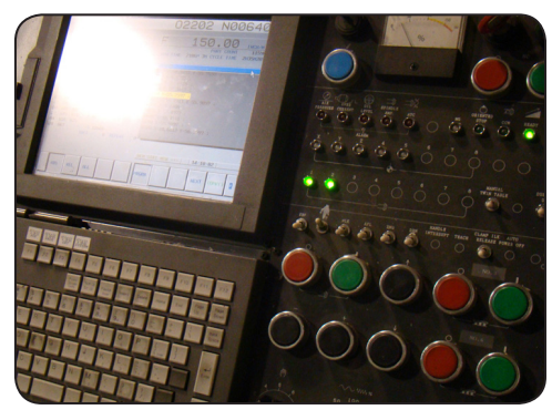
On the floor programming allows our operators to tweak the program for tool offsets and dial it in.