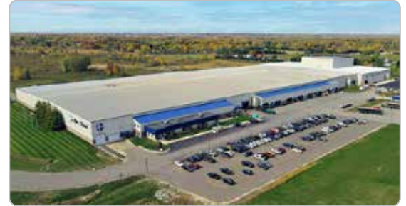
Pictured, the Alro Steel facility in Pottsville, Michigan