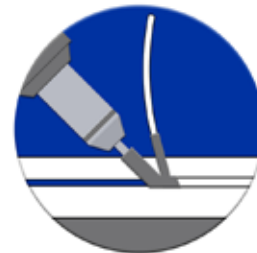
Welding Hot Gas & Extrusion