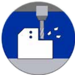
Milling Parts up to 6" thick