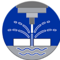
Waterjet Cutting Sheets up to 10" thick