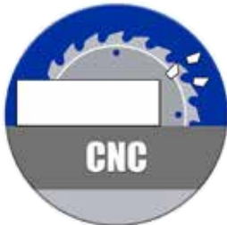
Panel Saw Cutting Sheets up to 8" thick