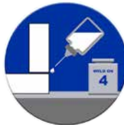
Bending & Gluing Formed & Fabrication Parts