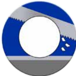
Band Saw Cutting Rounds up to 18" diameter