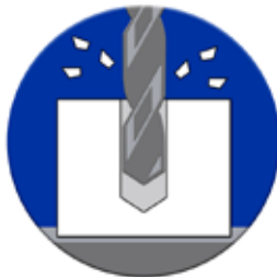
Drilling & Tapping Value added processing