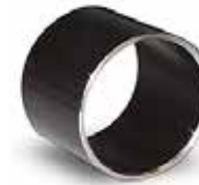
Round Pipe & Tubing