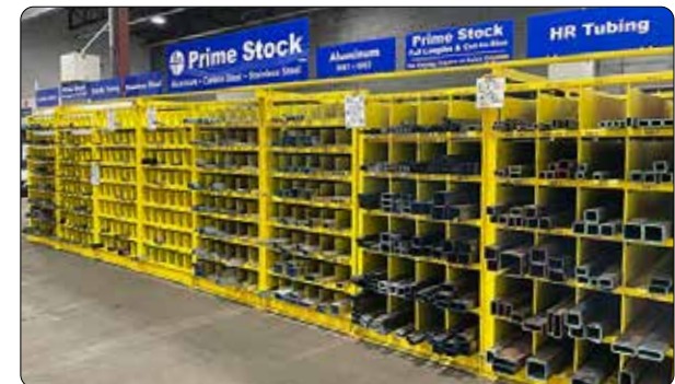
Browse through our large selection of easily identifiable metal bar stock