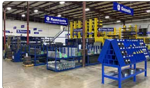
We stock a large selection of carbon steel, aluminum, copper, tool steel, stainless steel, brass and plastics