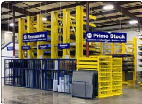
Our Alro Metals Outlets are your one-stop shop for all your metals and plastics needs