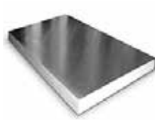
Sheet Metal Plate & Flat Bar