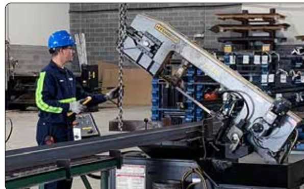
We offer cut-to-size saw cutting