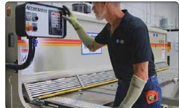
On-site shearing is available as well