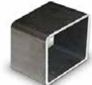
Rectangular & Square Tube