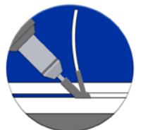
Welding Hot Gas & Extrusion