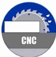
Panel Saw Cutting Sheets up to 8" thick