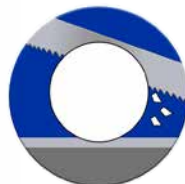
Band Saw Cutting Rounds up to 18" dia.