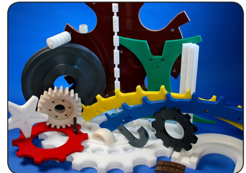
With 30+ years in the industry and ISO certification you can count on high quality parts.