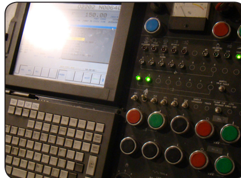
On the floor programming allows our operators to tweak the program for tool offsets and dial it in.