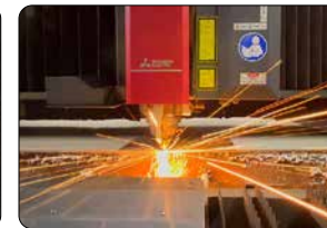
Plate Laser Cutting