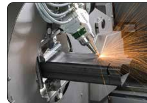
Tube Laser Cutting

America's Premier Metals & Plastics Service Center