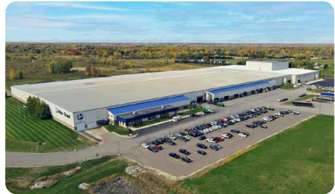
Pictured above, the Alro Steel facility in Pottsville, Michigan

Florida Michigan Oklahoma Illinois Missouri Pennsylvania Indiana New York Virginia Kentucky North Carolina Wisconsin Ohio