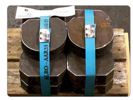
Edges ground on all flame cut pieces to deburr them for safer handling.