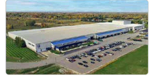
Pictured, the Alro Steel facility in Potterville, Michigan