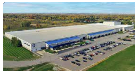
Pictured, the Alro Steel facility in Pottsville, Michigan

Florida Michigan Pennsylvania Illinois Missouri Tennessee Indiana New York Virginia Iowa North Carolina Wisconsin Kentucky Ohio Maryland Oklahoma