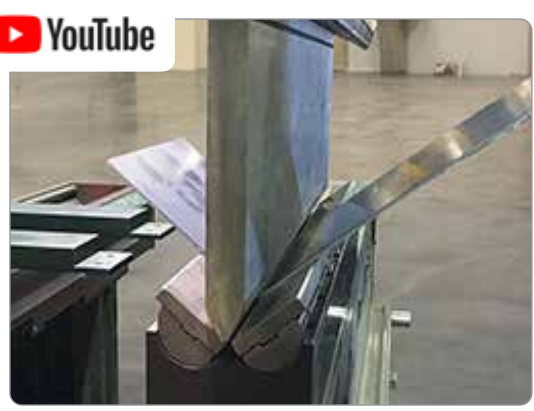
With use of static surface tooling technology, minimal to no distortion of holes near bend lines is achievable along with creating smaller leg lengths than ever before.