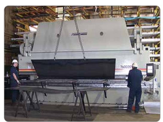
Our 20 ft. press allows us to service a wide spectrum of the forming market.