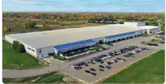
Pictured, the Alro Steel facility in Potterville, Michigan