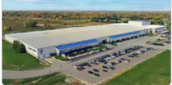
Pictured, the Alro Steel facility in Potterville, Michigan