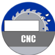
Panel Saw Cutting Sheets up to 8" thick