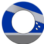
Band Saw Cutting Rounds up to 18" dia.