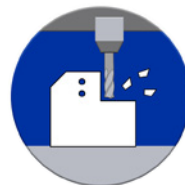
Milling Pieces up to 6" thick