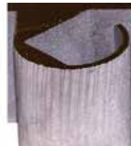
80% Through Cut