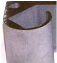
20% Excellent Edge Finish