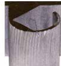
100% Separation Cut

Surface finish and tolerance are determined by feed rate. Finish and tolerance are directly proportional to cost.