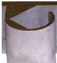
40% Good Edge Finish