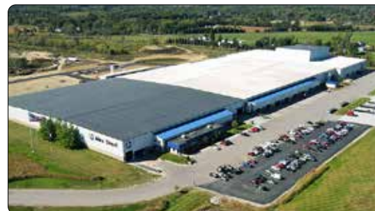
Pictured, the Alro Steel facility in Potterville, Michigan