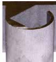
60% Clean Cut