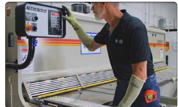
On-site shearing is available as well