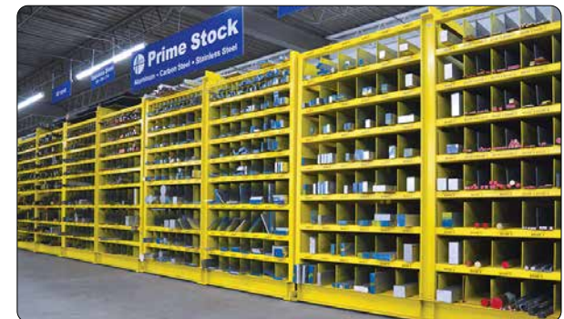
Browse through our large selection of easily identifiable metal bar stock