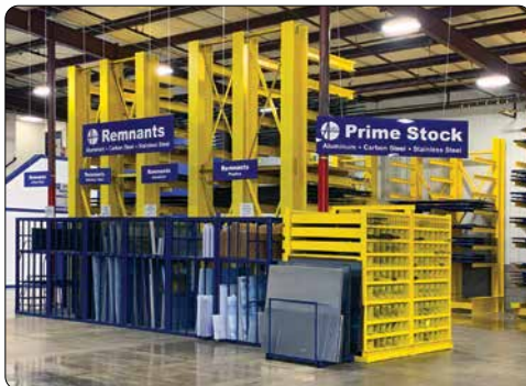
Our Alro Metals Outlets are your one-stop shop for all your metals and plastics needs