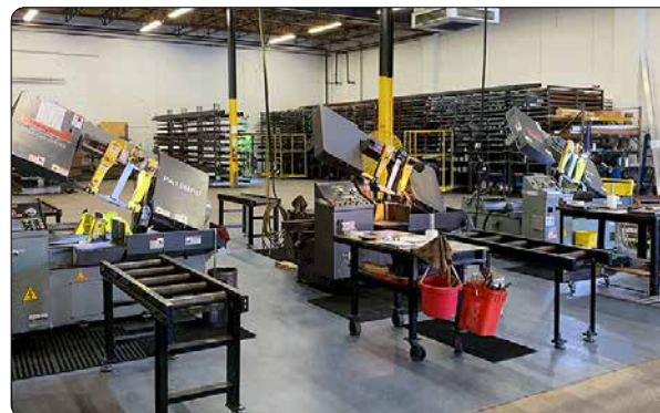
We offer cut-to-size saw cutting