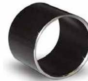
Round Pipe & Tubing