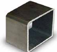
Rectangular & Square Tube