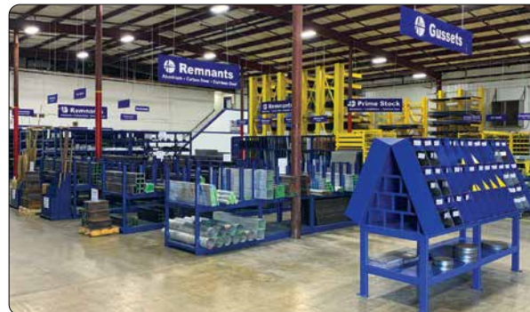
We stock a large selection of carbon steel, aluminum, copper, tool steel, stainless steel, brass and plastics