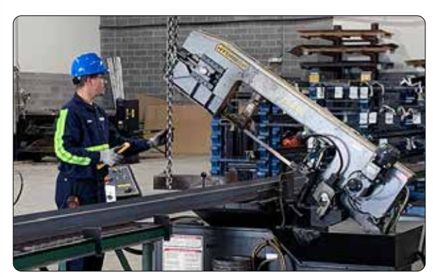
We offer cut-to-size saw cutting