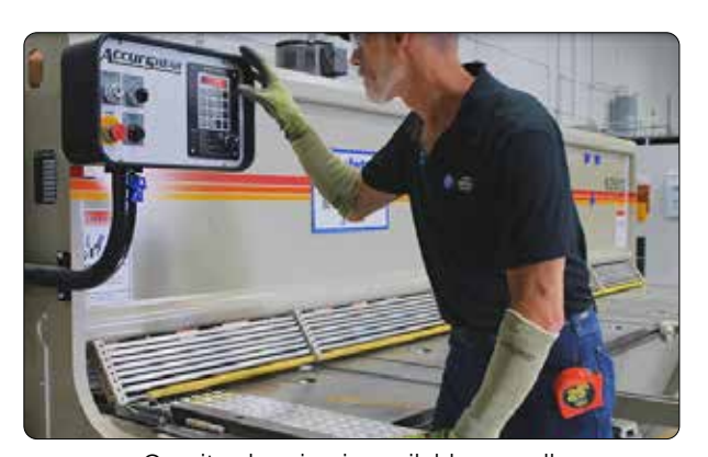
On-site shearing is available as well