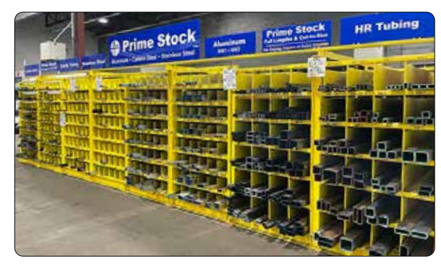
Browse through our large selection of easily identifiable metal bar stock