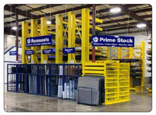
Our Alro Metals Outlets are your one-stop shop for all your metals and plastics needs