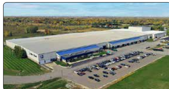
Pictured, the Alro Steel facility in Pottsville, Michigan

Florida Michigan Pennsylvania Illinois Missouri Tennessee Indiana New York Virginia Iowa North Carolina Wisconsin Kentucky Ohio Maryland Oklahoma