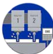
Routing Sheets up to 4" thick