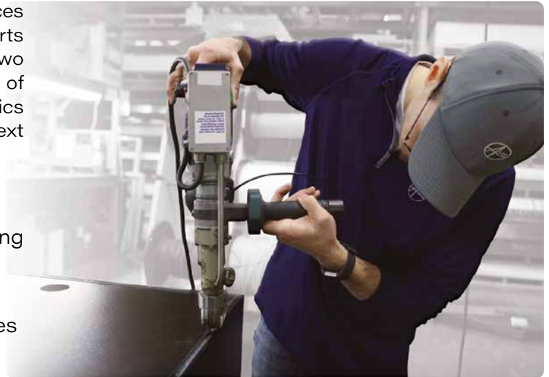
Pictured, a modified extrusion welder being used to weld a custom container

Alro Plastics has invested the time and resources to be a quality supplier of welded plastic parts and displays. From the simple welding of two sheets together to the complex assembly of custom fabricated, large containers, Alro Plastics has you covered. Please keep us in mind the next time you have a welding opportunity.