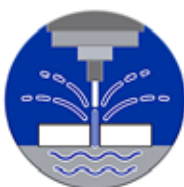
Waterjet Sheets up to 10" thick