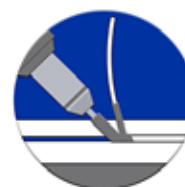
Welding Hot Gas & Extrusion