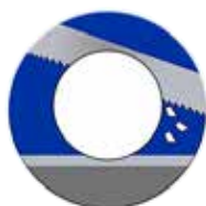
Band Saw Cutting Rounds up to 18" dia.