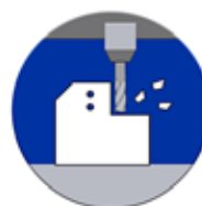
Milling Pieces up to 6" thick