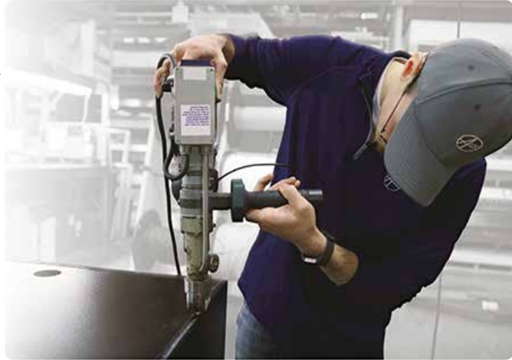
Pictured, a modified extrusion welder being used to weld a custom container

Alro Plastics has invested the time and resources to be a quality supplier of welded plastic parts and displays. From the simple welding of two sheets together to the complex assembly of custom fabricated, large containers, Alro Plastics has you covered. Please keep us in mind the next time you have a welding opportunity.