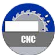
Panel Saw Cutting Sheets up to 8" thick