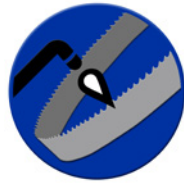
Band Saw Blade Welding