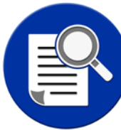
Sling Inspection & Certification