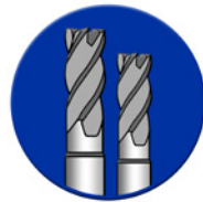
Cutting Tool Resharpener