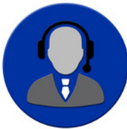
Technical Factory Support