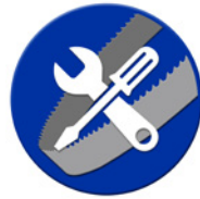
Band Saw Maintenance