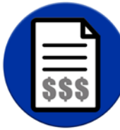
Cost Savings Documentation