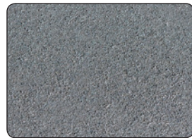
Grade 1 - Fine

A fine surface with minimum surface depth variation for comfort where pedestrian traffic flow is not directional only, but requires a lot of turning and reversing and is subject to only moderate thin liquid accumulation