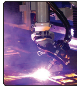
Our HPR 400 plasma cutting machine with bevel cutting capabilities.

Our advanced plasma cutting machine, with five axis bevel capabilities is capable of cutting 2" thick carbon plate with less than 1 degree bevel.