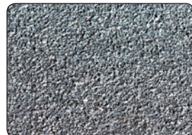
Grade 3 - Coarse

A coarse surface applicable for extremely heavy traffic and higher debris accumulation and high viscosity fluids