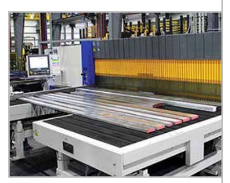
Video available on VouTube