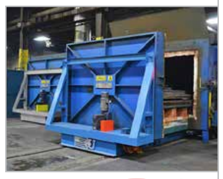
Video available on 🔼 YouTube