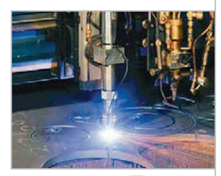
Video available on VouTuhe