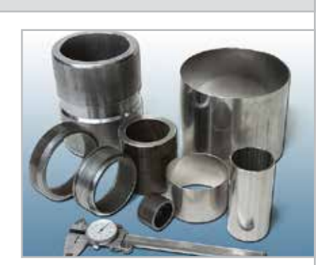
Video available on YouTube