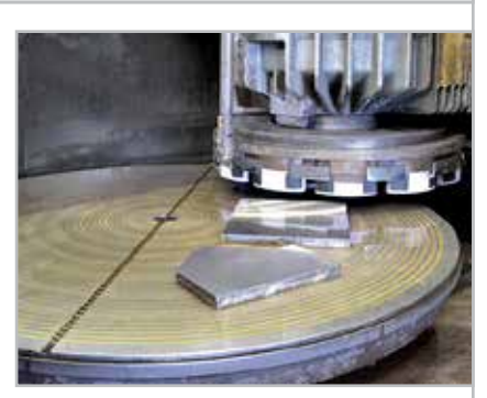
Video available on PouTube

Reciprocal Grinding : For jobs requiring a smoother finish and a tighter tolerance, Alro offers Reciprocal Grinding with a surface capacity up to 48" x 120"