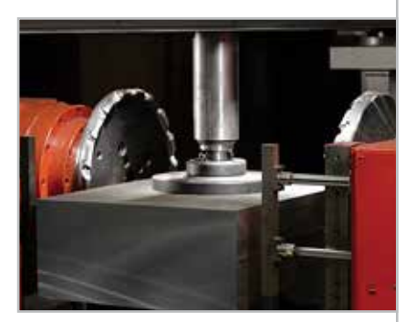
Video available on VouTube