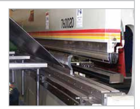
Video available on VouTube

Alro continually invests in new technology and updating their machines to provide the highest quality parts with the following advantages: