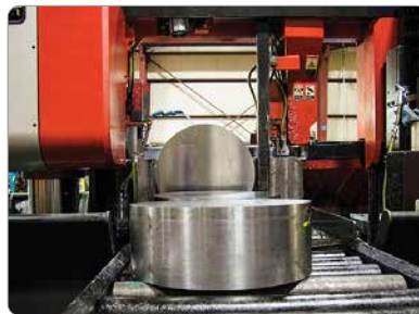
We offer bar sawing and can cut bar stock up to 28" diameter round.