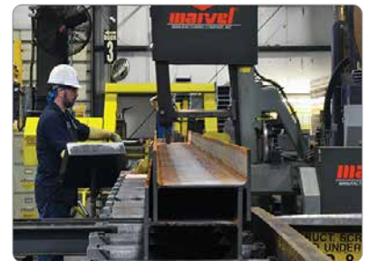
Maximizing bundle cutting production flow assures fast and accurate processing.