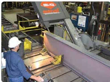
State of the art sawing systems deliver accurate miter saw cut parts.

This chart is a guideline only. For more specific information please contact your Alro representative.