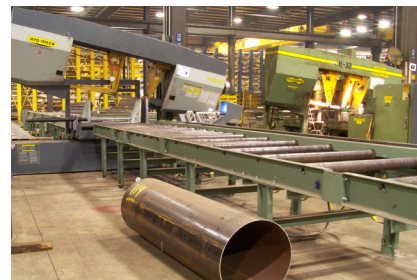
We are equipped to cut structural materials for handling or to your exact specifications.