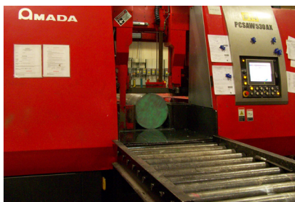
New State-of-the-art Pulse Cutting Technology.

All Alro warehouses employ state-of-the-art equipment for handling and processing orders. We can cut your material to a specified length for storage or handling.