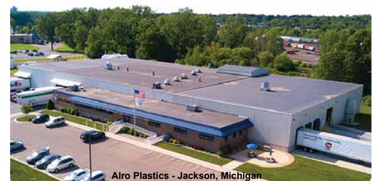
Airo Plastics - Jackson, Michigan

12171 62nd Street Suite #150 Largo, FL 33773 Ph: (727) 573-1480