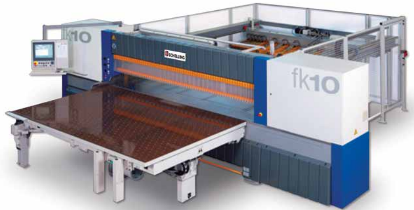
Pictured, one of our many production cutting, CNC Panel Saws