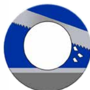
Band Saw Cutting Rounds up to 18" dia.