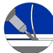
Welding Hot Gas & Extrusion