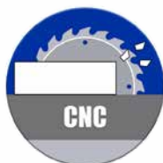
Panel Saw Cutting Sheets up to 8" thick