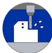
Milling Pieces up to 6" thick