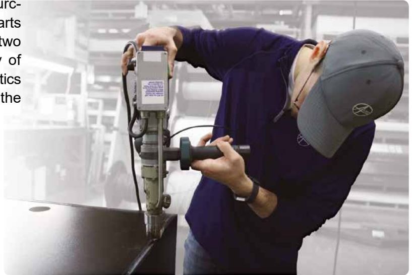
Pictured, a modified extrusion welder being used to weld a custom container

Alro Plastics has invested the time and resources to be a quality supplier of welded plastic parts and displays. From the simple welding of two sheets together to the complex assembly of custom fabricated, large containers, Alro Plastics has you covered. Please keep us in mind the next time you have a welding opportunity.