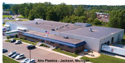
Airo Plastics - Jackson, Michigan

12171 62nd Street Suite #150 Largo, FL 33773 Ph: (727) 573-1480