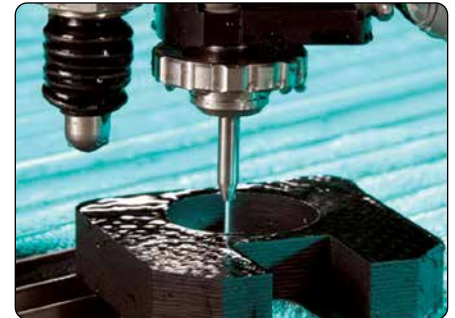
Hardest Plastics Cuts glass-filled and fiberglass products