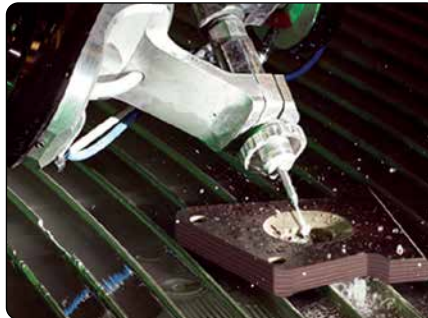
5-Axis Technology Bevels and 3D cutting made easy