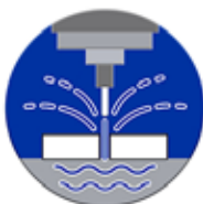
Waterjet Sheets up to 10" thick