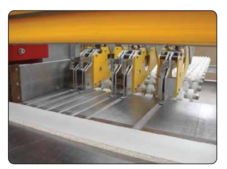
Thick Sheet / Slab Grippers can grab and pull in slabs up to 8"