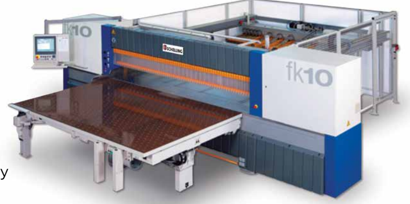
Pictured, one of our many production cutting, CNC Panel Saws