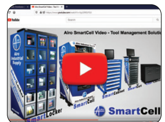
Check Out Our Youtube Video