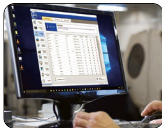
Alro's Proprietary SmartCell™ Software

Alro is Your Source for Smart Solutions to all Your Tool Management Needs!