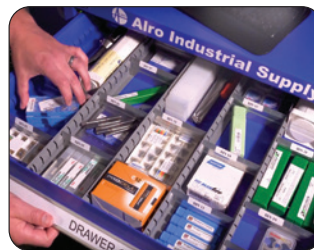
Customizable and Secure Drawers