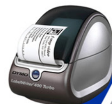
Dymo LabelWriter 400 Turbo Printer