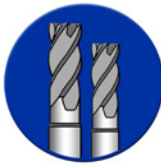
Cutting Tool Resharpener