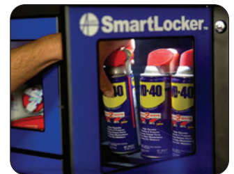
Large Product Security Options