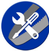
Band Saw Maintenance