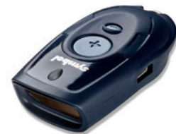
Symbol CS1504 Barcode Scanner