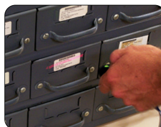
APOS - Alro's Portable Ordering System