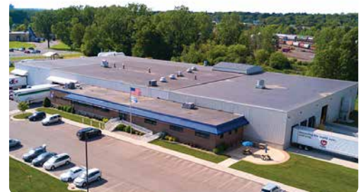
Alro Plastics - Jackson, Michigan

12171 62nd Street Suite #150 Largo, FL 33773 Ph: (727) 573-1480