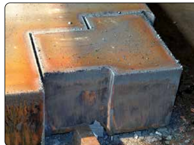
Parts cut to customer-supplied print specifications.