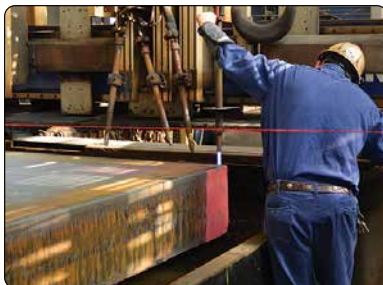
Alro can provide flame cut parts up to 14" thick.

This chart is a guideline only. For more specific information please contact your Alro representative.