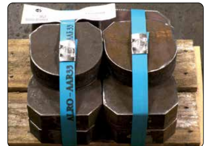
Edges ground on all flame cut pieces to deburr them for safer handling.