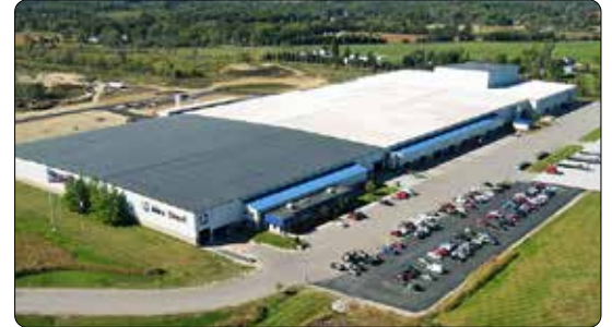
Pictured, the Alro Steel facility in Potterville, Michigan