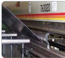
Press Brake Bending & Forming