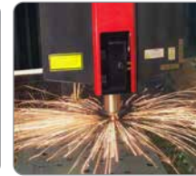
Plate Laser Cutting