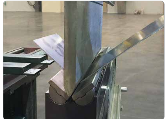
With use of static surface tooling technology, minimal to no distortion of holes near bend lines is achievable along with creating smaller leg lengths than ever before.