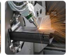
6-Axis Laser Cutting