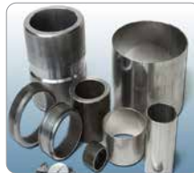
Tube Cutting and Chamfering