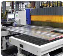
Precision Plate and Structural Saw Cutting