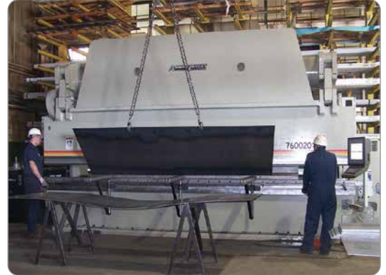
Our 20 ft. press allows us to service a wide spectrum of the forming market.