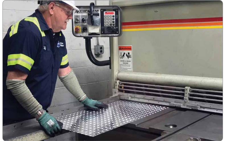
Our shears have a maximum plate capacity of 1/2" thick x 144" x 144"

We are capable of shearing plate up to 1/2" thick. Thickness capacities vary depending on the grade of the material. Please inquire.