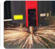
Plate Laser Cutting