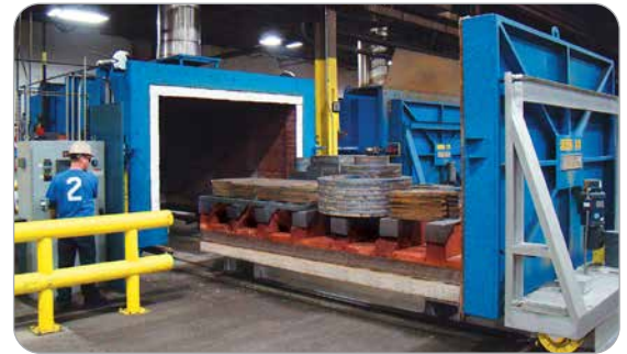
Our furnaces are 96" wide x 144" long x 54" high