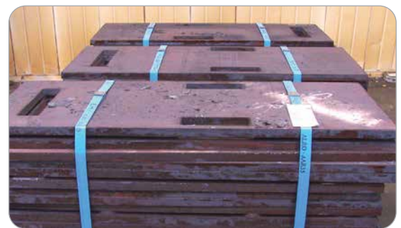
Order flame cut pieces to your specifications, annealed and ready to ship to your location.