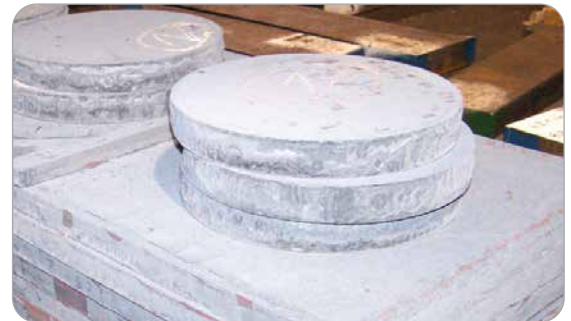
These furnaces have a weight capacity of 30,000 lbs.